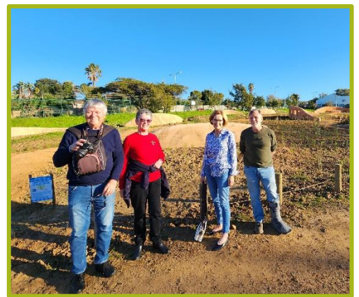
Tygerberg RC project in the Majik Forest Garden.